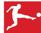
Connecting referees in Germany's top football league