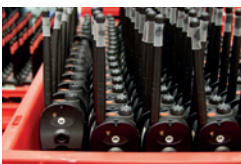
Intercom & Professional Mobile Radio Solutions