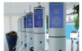
Access Control & Accreditation Solutions