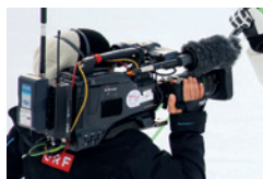
RF Camera Solutions